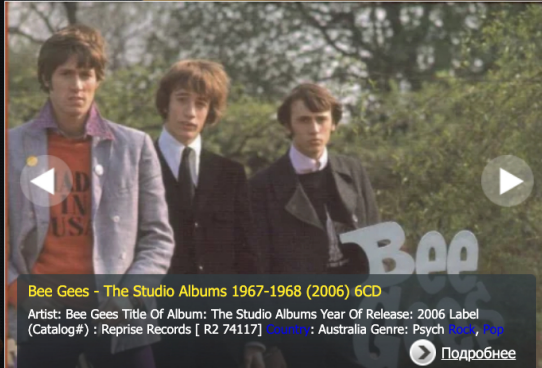
Bee Gees - The Studio Albums 1967-1968 (2006) 6CD Artist: Bee Gees Title Of Album: The Studio Albums Year Of Release: 2006 Label (Catalog#) : Reprise Records [ R2 74117] Country: Australia Genre: Psych Rock Pop