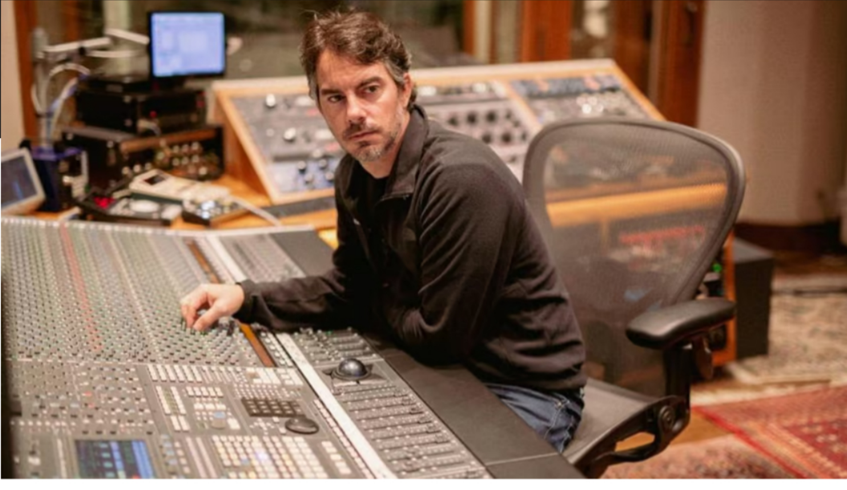
(Hummingbird Media, Inc.)

By Hummingbird Media 1 · Nov 3, 2022 11:24pm